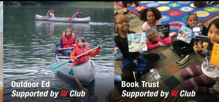
Outdoor Ed Supported by W Club