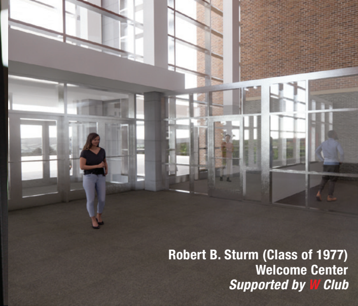
Robert B. Sturm (Class of 1977) Welcome Center Supported by W Club

ONCE A WARRIOR ALWAYS A WARRIOR TURN YOUR SUPPORT INTO ACTION