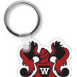
Warrior Key Chain